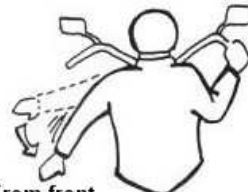
From front to back Don't pass me