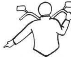
Hazards on the road