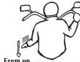
From up to down Slow down