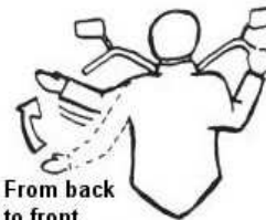
From back to front Go ahead and pass me